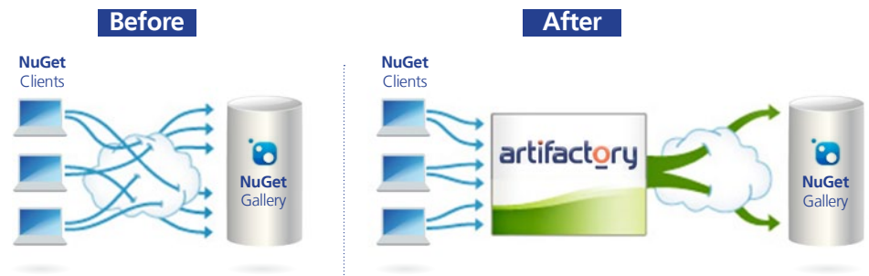
Accessing NuGet Gallery Metadata

always have access to the packages in your system, and your builds won't be held up by issues with the network or the NuGet Gallery.